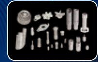
PARTS & SERVICE